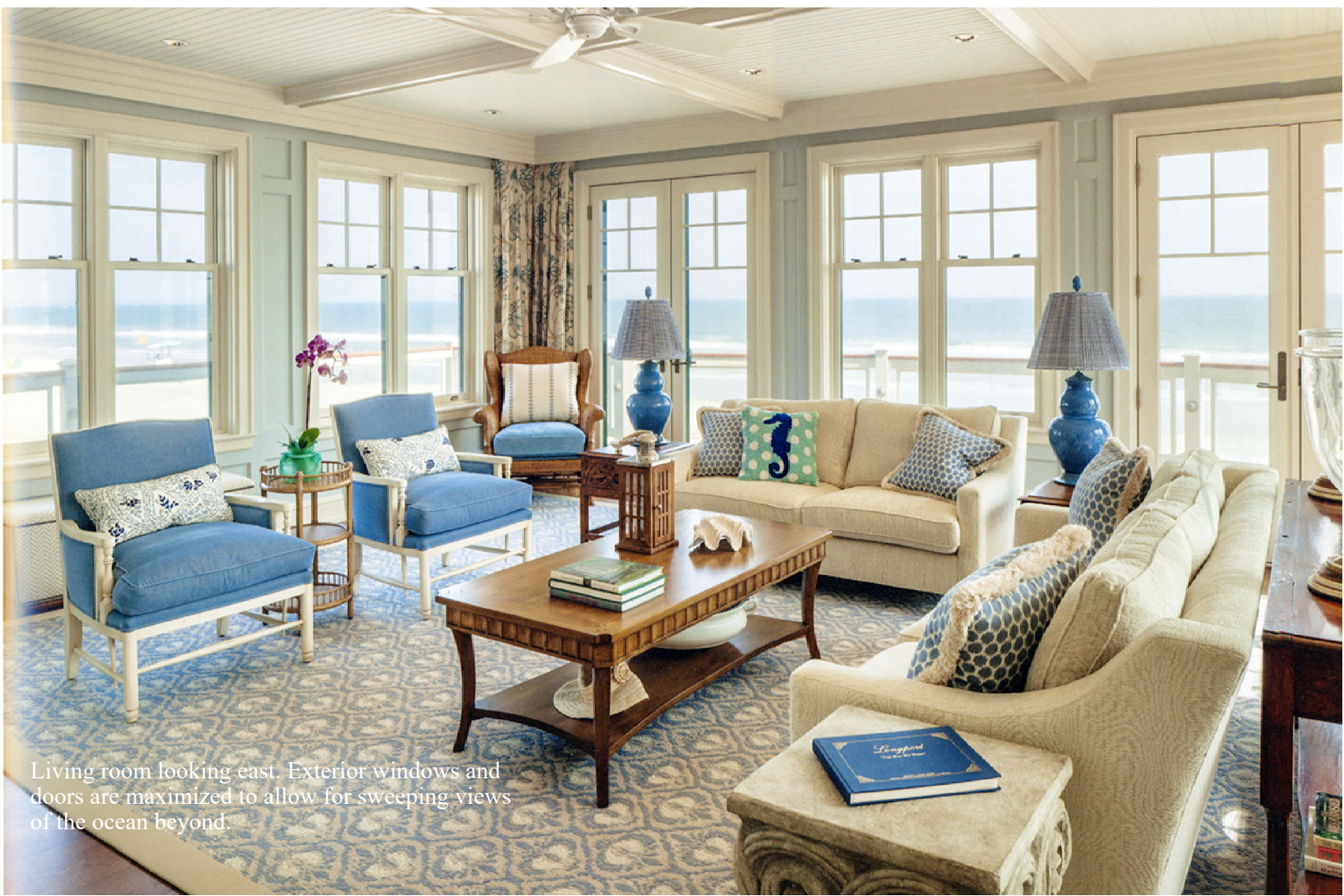
Living room looking east. Exterior windows and doors are maximized to allow for sweeping views of the ocean beyond.