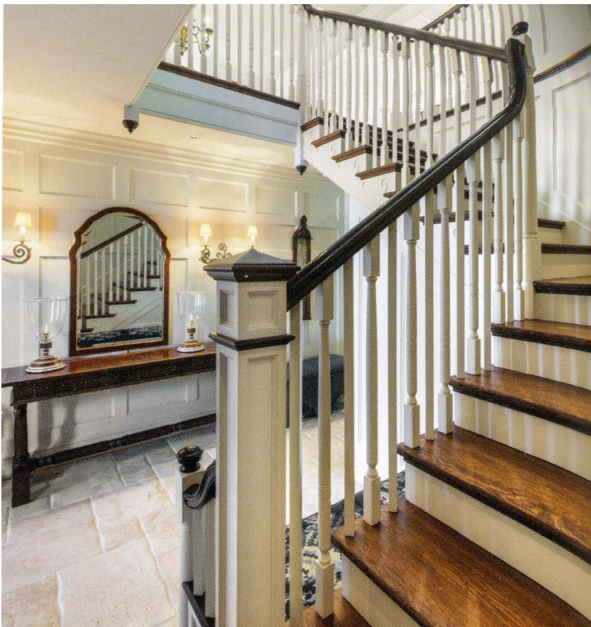
Main stair between first and second floors