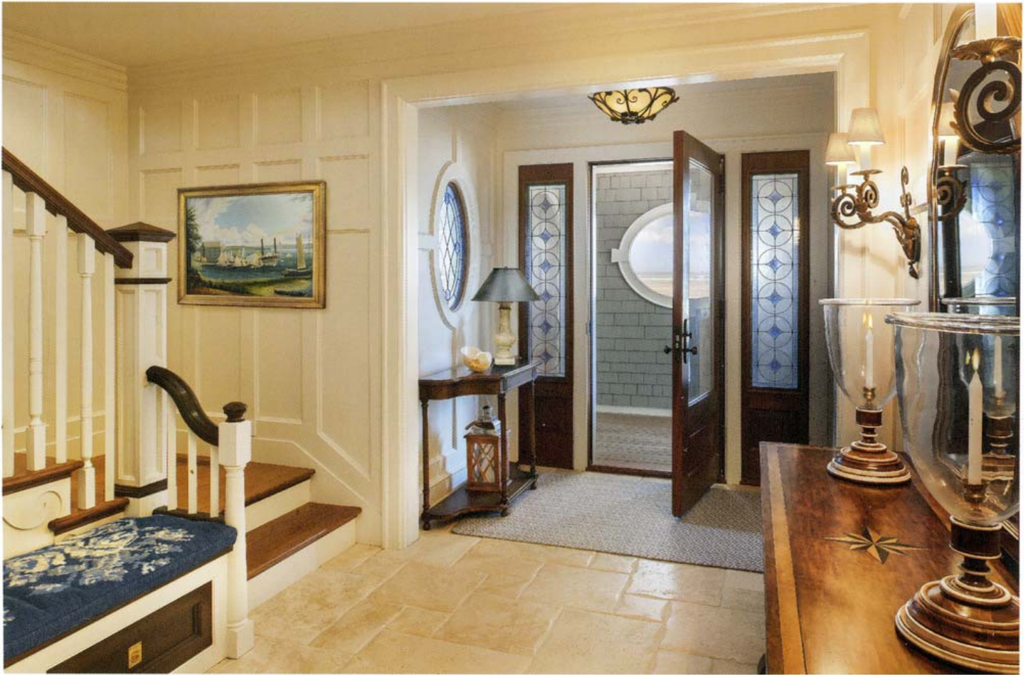
Entry hall looking towards front door and main stairs