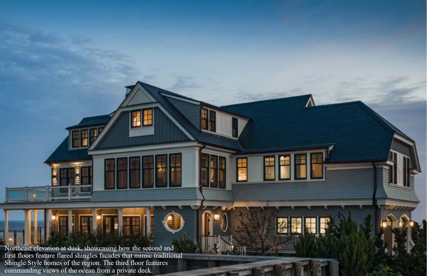
Northeast elevation at dusk, showcasing how the second and first floors feature flared shingles facades that mimic traditional Shingle Style homes of the region. The third floor features commanding views of the ocean from a private deck.

This new residence occupies a unique position on the New Jersey shore, with expansive sandy beaches on two sides and spectacular views to the north, east and south.